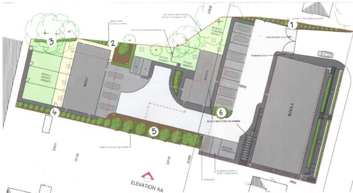
Tree planting and landscaping plan